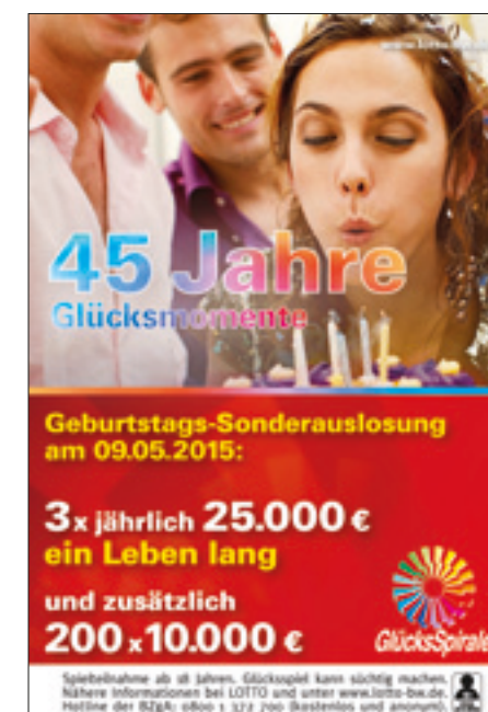
GlücksSpirale 2015 advertising theme.