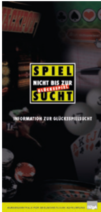
The 'Spiel nicht bis zur Glücksspielsucht' (Don't play to addiction) brochure is on visible display in every authorized retailer in Baden-Württemberg.