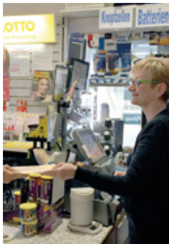
Birgits Lädle in Esslingen Hegensberg has been serving local customers for more than 16 years. And what makes it special? "There is nothing that you won't find here and you get really good advice", say its customers.

In 2015, training courses were provided in the areas of product knowledge, the use of online technology and preventing gambling addiction/protecting young persons. In addition to traditional face-to-face training courses, in 2015 a new e-learning portal was installed for the authorized retailers in Baden-Württemberg, enabling them and authorized retailers and their employees to undergo further training on the gaming business independent of time and location. For example, the introduction of this new learning platform enabled an online training course to be developed in 2015, which helps the authorized retailers to guarantee the protection of underage people and customers during day to day operations. At the end of the year, a learning module developed for the prevention of gambling addiction by the Evangelische Gesellschaft Stuttgart was introduced. Every authorized retailer employee will be required to complete during the course of 2016.