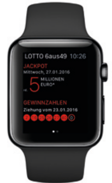
Lotto on your wrist: In November 2015, the company launched an app especially for the Apple Watch.

Since March 2012, it has also been possible to play the lottery via the website www.lotto.de . On the basic page of all 16 state lottery companies, the user is asked to select his home state. Baden-Württemberg residents who play the lottery at lotto.de play on the www.lotto-bw.de page once they have registered successfully.