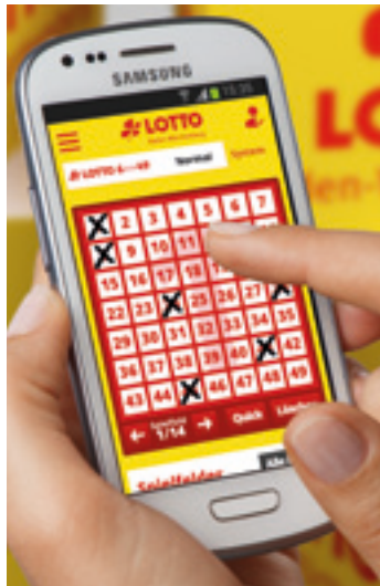
Playing the lottery on the move: Players are increasingly playing the lottery via their Smartphone.

Today's customers want to play the lottery anytime anywhere. In future, the majority of games will still be played in the state's authorized retailer shops. To provide customers with a better service, Lotto Baden-Württemberg online service undergoes constant improvements. Whether via the website or app for the Smartphone: customers can find out about the latest products any time, and play the lottery.