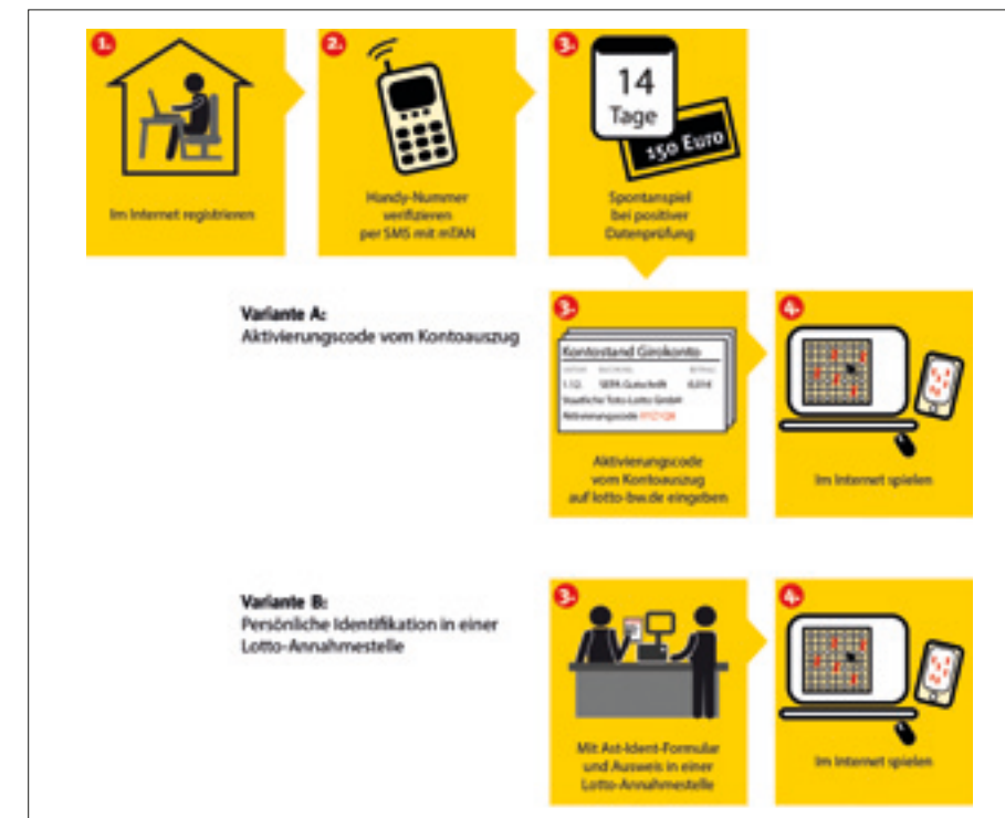
Simplified and customer-friendly registration process. The process was again optimized in 2015. The protection of young people and operating lotteries responsibly remain the top priority.