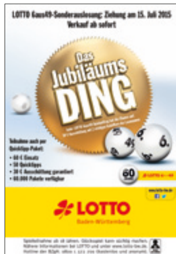
Advertising theme from 2015.

The company still faces strict restrictions on advertising and sales. One result of this was that the number of authorized retailers in Baden-Württemberg again fell slightly in 2015. Illegal providers of so-called 'black lotteries' – providers offering bets on lotteries such as LOTTO 6aus49, Eurojackpot and KENO from other countries – continue to operate in the market. These 'secondary lotteries' have once again had a negative impact on the company's stakes. The current enforcement deficit has been having negative impacts on the situation of state lotteries in Germany for many years. There has been no reversal of this trend.