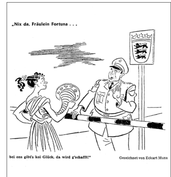
Stuttgarter Nachrichten, May 11, 1957.

Germany took an important step in limiting illegal gambling and increasing player protection at the end of 2015: The German supervisory authorities, in the form of the Glücksspielkollegium, published a whitelist. It listed those providers who, in different gambling segments, hold a valid permit to operate in Germany. Any provider not on this list is operating in