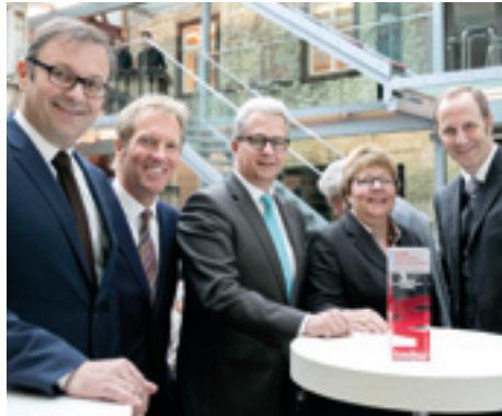
The first Lotto-Museum Award went to the Ravensburg Museum Humpis-Quartier. To mark the award, Lotto Baden-Württemberg granted free entrance to every visitor over the weekend.

The choice of media has probably never been as wide-ranging as it is today. To be constantly noticed, you need to draw attention to yourself in the 'media jungle' and engage partners. This engagement and supporting the common good is firmly rooted in the company's communications. Lotto Baden-Württemberg has been using its own resources to support culture and sports since the beginning of the 1990s. It has always had a concern for regional balance and the ongoing protection of players and young people. Collaborative projects in the field of preservation of monuments and social initiatives complete the comprehensive programme of sponsorship.